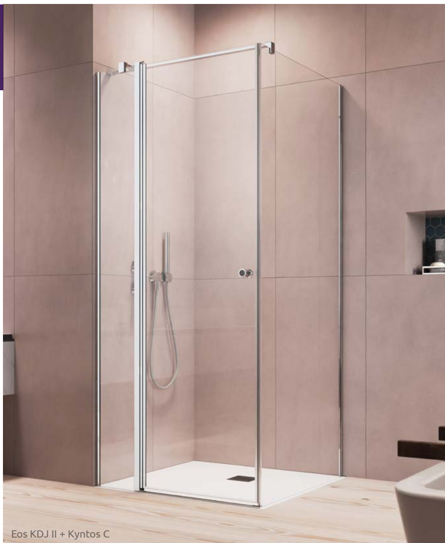
Eos KDJ II + Kyntos C

Shower enclosure set consists of 2 parts: door and sidewall. Please specify both article numbers when making an order.