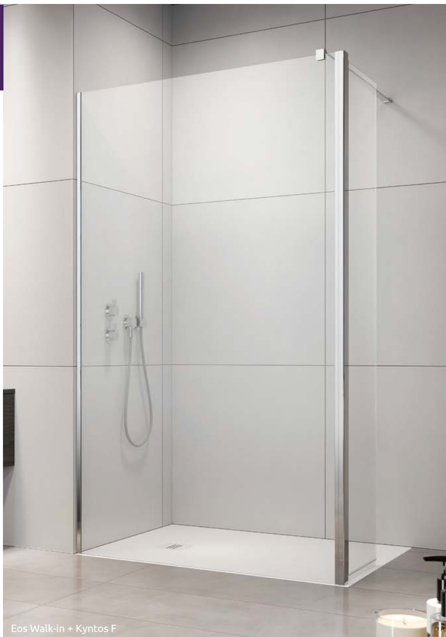
Eos Walk-in + Kytos F